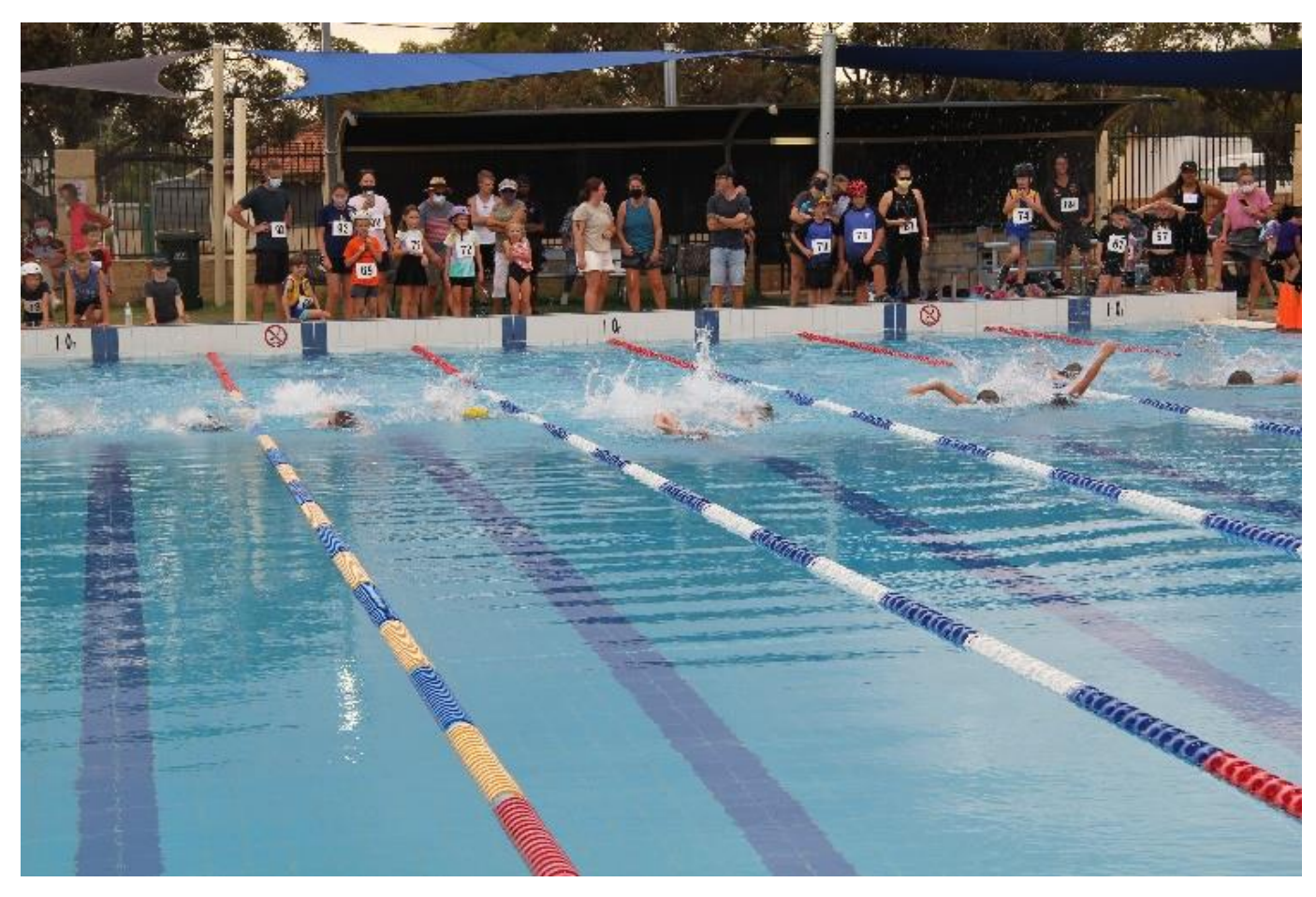
Narembeen Triathlon 2022

The triathlon marks another important and popular event for the community. After feedback from many community members the Narembeen CRC allowed little athletes to participate in this year's triathlon. This was a huge success and many children competed.