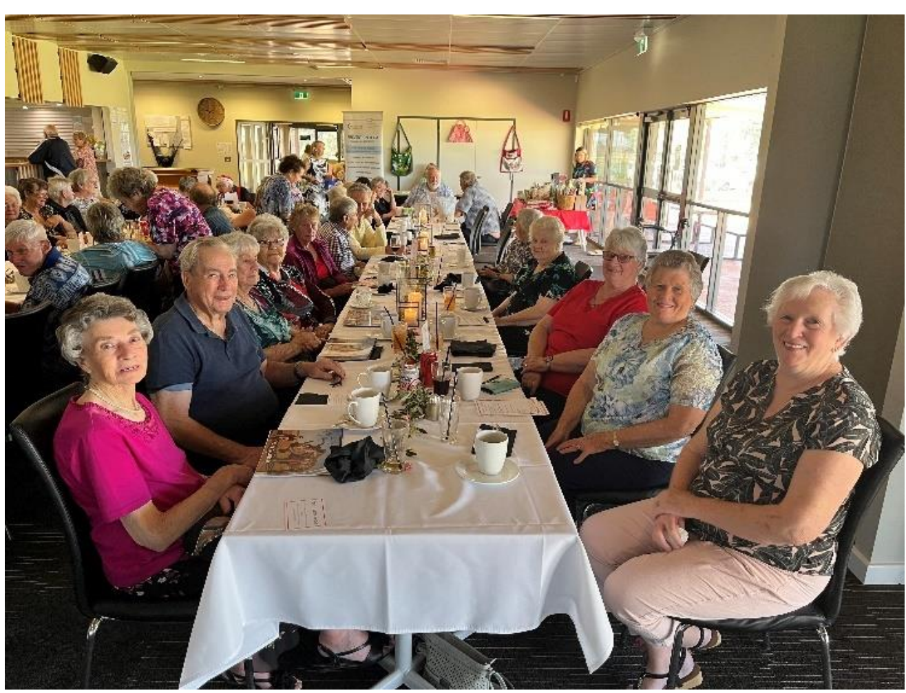
Seniors Luncheon 2022