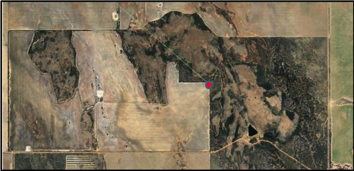
Above: Site Plan

The application is for a proposed sea container to be placed adjacent to the existing tower. The 20 foot sea container is proposed to house radio equipment, a battery system and will include solar panels on the roof.