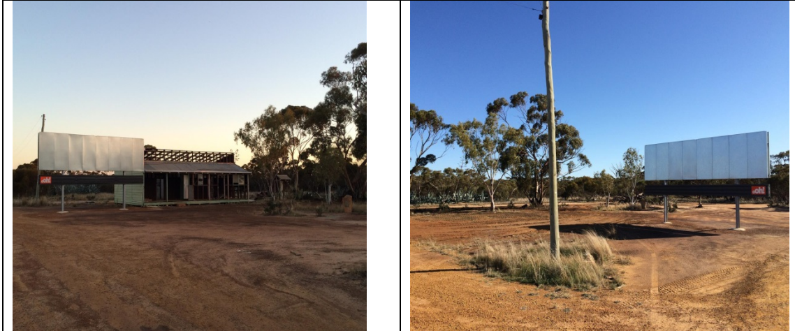
10 th June whole building removed