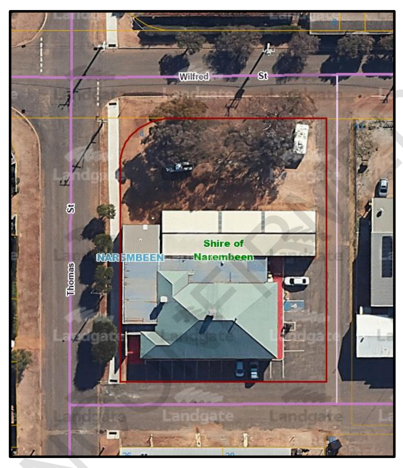
Above: Lot 305 shown in red outline