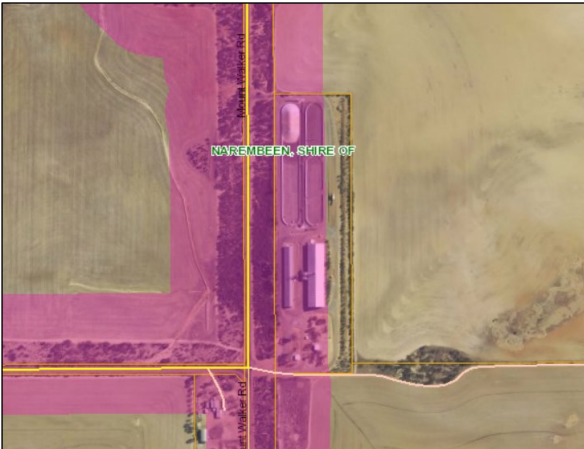
Mapping showing declared bushfire prone area in pink – www.dfes.wa.gov.au