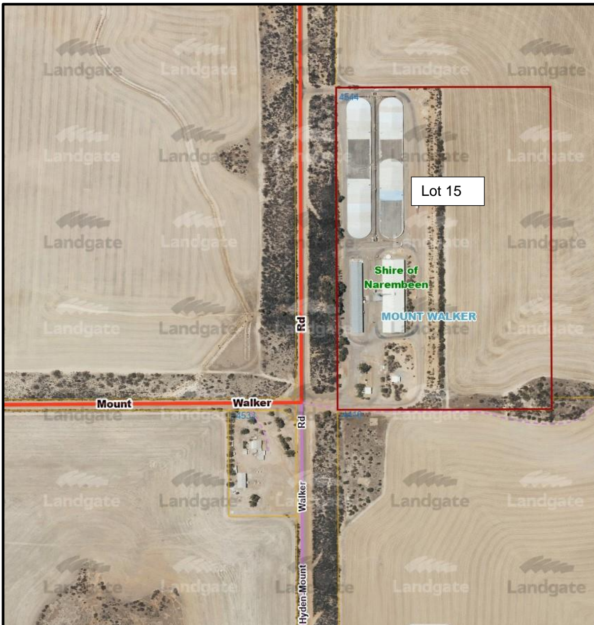
Above: Aerial showing Lot 15

At the Ordinary Council Meeting held on the 19 July 2022, Council resolved to grant delegated authority to the Chief Executive Officer to deal with requests seeking an exemption from the need for planning approval for temporary works (MIN 7464/22) .